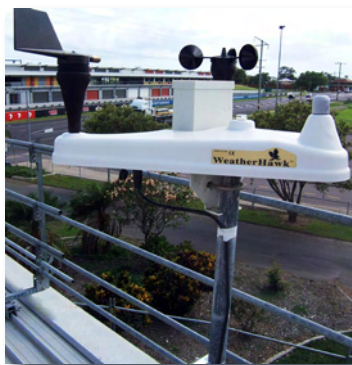
Figure 2: T.S.H.S. WeatherHawk mounted on the Library Roof.

The WeatherHawk weather station measures Air Temperature, Relative Humidity, Barometric Pressure, Solar Radiation, Rainfall, Wind Speed and Wind Direction. The data collected is transmitted via the built-in radio to a PC, which uses the Virtual Weather software package designed specifically for the WeatherHawk to display this information on the school's website. (See Figure 3.)