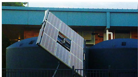
Figure 1: View of the front of T.S.H.S. featuring the RAPS, Wind Turbine and Generator

By November 2006 a stand-alone hybrid Remote Area Power System (RAPS) had been installed at the front of the School and made operational. (See Figure 1). This technology is highly visible, comprising a Solar Array Pyramid capturing the sun's energy, a 6 metre tower supporting a Ropatec Wind Turbine and Generator and a fully automated WeatherHawk wireless weather station. The electrical energy produced from the sun and wind can now power the lighting and appliances use in a nearby classroom.