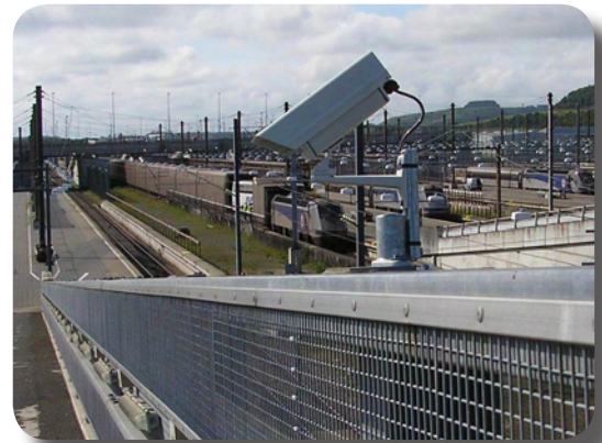
In adverse weather conditions some areas need to have weather warnings displayed, alerting users to possible danger.

This original road weather information system (RWIS), in place for around 15 years, was in need of replacement due to computer obsolescence and the increasing maintenance requirements of keeping an old system functioning effectively.