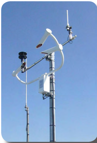
Six road weather stations have been installed to monitor the road during adverse conditions

At each end of the tunnel are sites with miles of roads, various bridges and some fairly steep ramps running down to the platforms where vehicles are loaded on and off the trains. During adverse weather some of these areas need to be gritted and weather warnings need to be displayed. A network of three road weather outstations at each site displays met data in each control centre to allow management decisions to be based on current weather conditions.